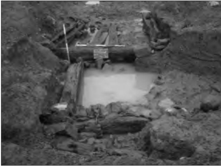
Closer shot of possible vertical mill in foreground replaced by later horizontal mill fed by same water course

Certainly the site discoveries add new dimensions to what was previously known about early powered milling in Ireland and when further thought and examination goes into the findings more knowledge will be added.