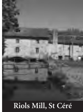
Riols Mill, St Céré