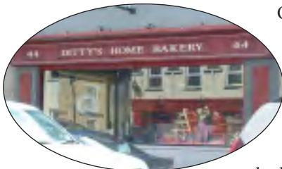
Ditty's Shop, Main Street, Castledawson. The normal shop front hides the extensive bakery premises to the rear.

luckily, they had taken the precaution of bringing an extra Chocolate Ganache so that all could get a taste. We departed Castledawson clutching our samples of bread. It had been a good day.