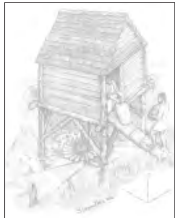
Sketch of how a horizontal mill may have looked by Simon Dick of CRDS Ltd.

At Raystown only the frame base timbers survive but they do show mortises at the corners to allow for the upright timbers, a notch for probably the flume and in one the bridge sole complete with stone bearing for the wheel shaft.