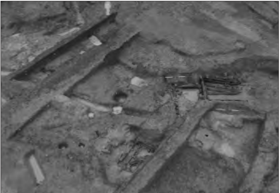
Aerial shot of 3 mill sites with accompanying water courses

The concentration of milling on a site which does not seem to be monastic, defensive or situated near the coast is very unusual. The tremendous effort required by the builders to obtain working mills in a seemingly unsuitable place which then probably became one of the main reasons for staying with the site for 500 years. Many of the horizontal mills discovered by archaeology in the last century are sited in such locations.