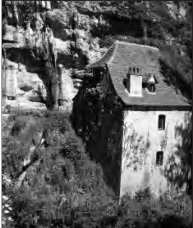
Miller's House, La Pescalerie, near St Cirq-Lapopie. The mill pond, fed by an underground river, is at the level of the eaves of the adjacent mill building, where four sets of stones on two levels worked. The stones are in situ; the machinery gone.

Of all the many wind and water mills we visited, only one still grinds commercially – the Riols watermill at St Cere produces specialist stone-ground flour for a nearby milling business. Milling or not, an awareness of the architectural, historic, social and technological importance of these pre-industrial revolution factories, is gaining momentum.